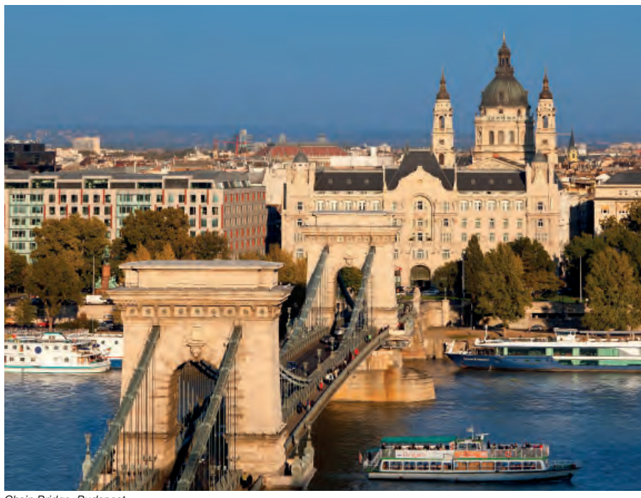
Chain Bridge, Budapes

Enjoy two full days in Budapest exploring the tree-lined boulevards of Pest and the cobbled hilly streets of Buda. The city straddles a curve in the River Danube and is packed with interesting sights to visit on foot but also easily reached by underground. Visit the Castle District in Buda where you can find mediaeval buildings such as the Royal Palace which has been rebuilt several times over the past seven centuries and houses the National Gallery, Budapest Historical Museum and the Museum of Contemporary Art. You can also visit the 13th Century St Matthias Church and the