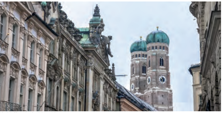
Munich (if coming back by train)

Enjoy a full German breakfast at your hotel before you check out and begin your journey back to London. You will take a train from Munich to Brussels with an easy change of trains in Frankfurt before boarding the Eurostar to London St Pancras.