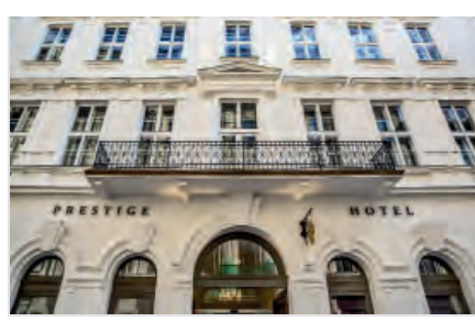
Hotel Prestige, Budapest

Hotel Torbrau is a family-owned hotel superbly situated at the gateway to Munich's Old Town. Rooms are comfortable, and the hotel offers a restaurant and restored wine cellar.