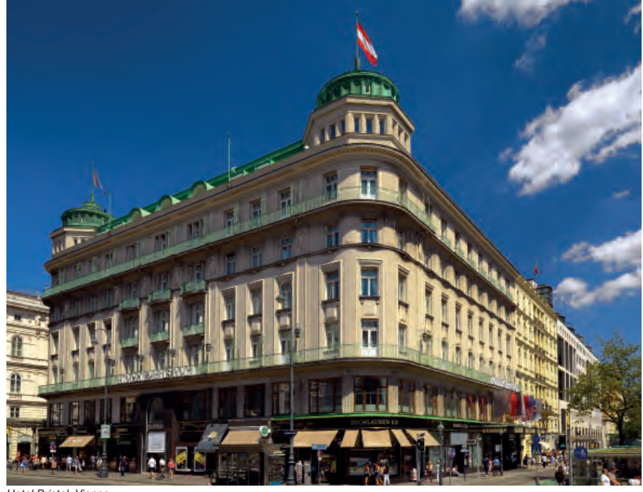
Hotel Bristol, Vienna